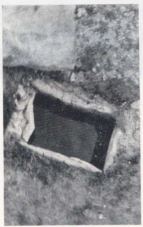
KISTVAEN, RENNY BROOK Barrows, 71st Report—To follow Plate 17,