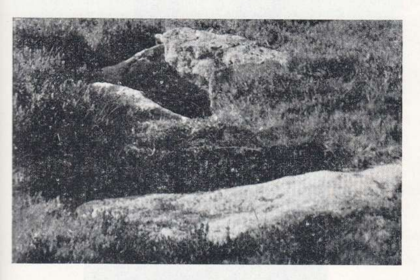
KISTVAEN, REDLAKE FOOT.