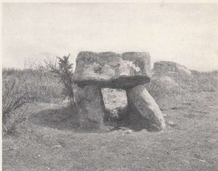
Fig. 1. MEACOMBE KISTVAEN, View looking S. 53° E.