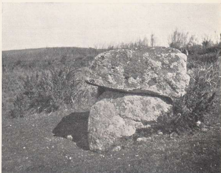
Fig. 2. MEACOMBE KISTVAEN, View looking N. 41°-30' E.